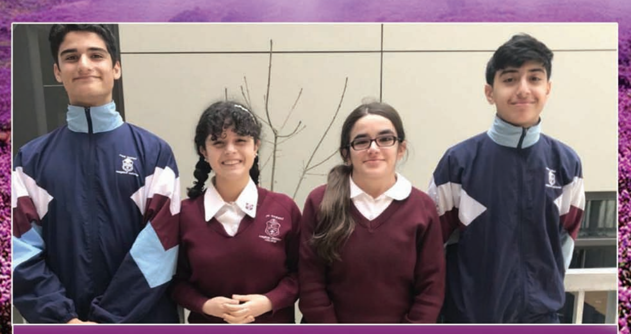
Top scoring Assyrian Schools students in the National Computer Science School (NCSS) Python Coding Competition in Sydney, Australia